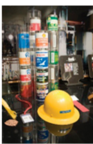
Products of Kaufman Holdings