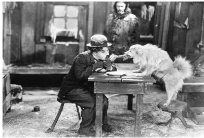
90th Anniversary Screening! THE GOLD RUSH