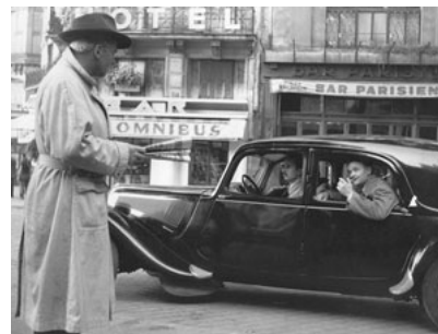
Signed Movie Posters