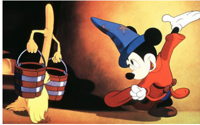
A sponsored message from the Skirball