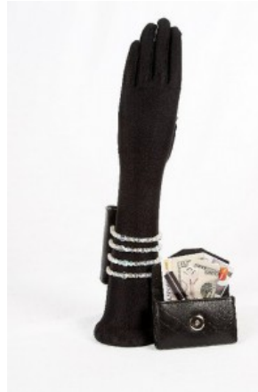
The Brilliant Purseless Purse

Even though others have tried to copy their fashionable designs, no one could come close to creating these extremely practical and very much needed wrist bracelets, which, amazingly enough, are really purses that incorporate both beautiful form and function at the same time. A bracelet becomes a purse! Now, that is something I would call genius besides that it is the latest fashion as well! Its easy to use, and "ready-to-run-with-you" nature is really a novelty, while it is also perfectly engineered to fit your wrist. It poses as an expensive piece of jewelry that one can wear on the red carpet, on a trip, or just run around in town, instead of carrying a purse. Yet, this unique design is indeed a purse that holds your credit cards, ID, and even lipstick. Each strand of crystals and beads are hand beaded and each strand is individually attached to the wallet to insure its safety and security. All designs are created by Deborah Burnett , who made every woman's dream come true and had been featured many times due to her brilliance. No more searching in your purse 24/7, but wearing all that you need on your wrist that is jewelry style, elegant, and a true eye-catcher. Now, this is really an American made item that is most definitely going around the world as the best and one of the smartest products ever created. And, as expensive as it looks, it is affordable! www.canaleoriginals.com