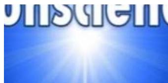
The Tool of the 21st Century: Creating with Conscience!