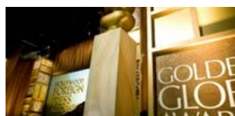
Inside the Golden Globes