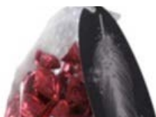
The Most Luscious Wisp of Happiness from Japan: Chocolate!