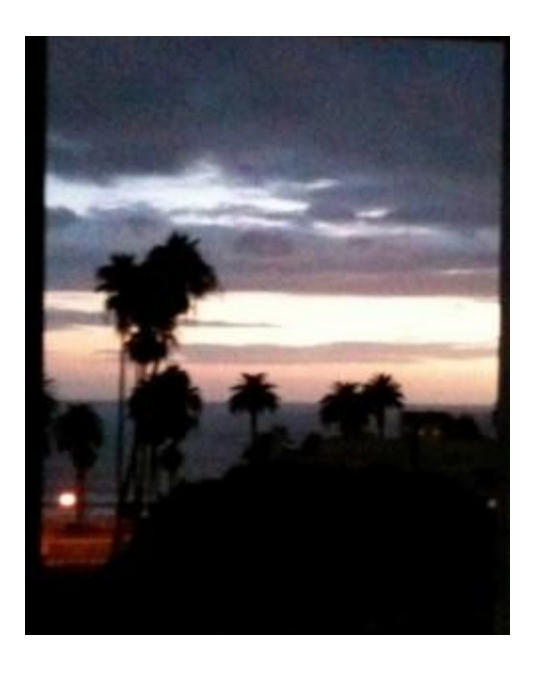
Creation, Photographed by AP

And, almost all of us know SOME of the theories, THEORETICALLY from history, but the time has come to practice them too! Learning about Jesus, Plato, Copernicus, Einstein, etc...eventually ending with the Bible is great, but the message has always been the same: Just do it!