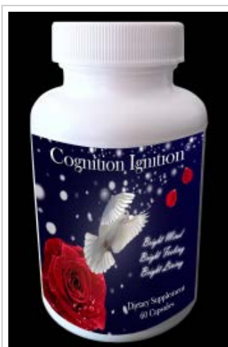
Cognition Ignition By DNA Associates

Luckily the world is changing and moving in a positive new direction. As part of this movement, we now have encouraging new products like Cognition Ignition, which offers advantages on many levels, all directed toward helping us live a