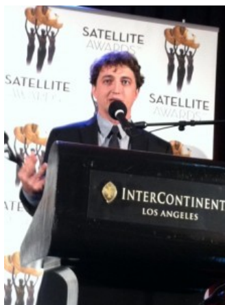
Benh Zeitlin, Director of "Beasts of the Southern Wild"

Supporting Actress: Anne Hathaway, "Les Miserables"