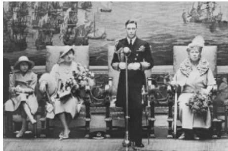
The first public speech George gave after the abdication in 1937. George's fear is palpable, but so too, is the strong encouragement and assured faith from his wife, Queen Elizabeth.

The King and Queen's displays of bravery by refusing to leave their country during some of the most perilous times England had ever seen, along with the optimism infused through the speeches of Prime Minister Winston Churchill and King George VI, motivated the British people to hold on to the thinnest of hopes