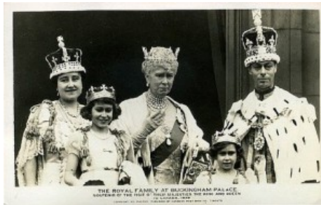
The Royal Family - Queen Elizabeth, Princess Elizabeth, The Queen Mother Mary, Princess Margaret, and King George

Veteran's Day piece I wrote about Sir Winston entitled, Giving Thanks To Victory and Veterans , I support this view: