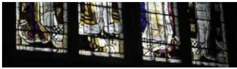
The Royal Family from Coronation Day 1937 immortalized in the stained glass of Canterbury Cathedral

Prime Minister brought this vision of a victorious future home by constantly waving a "V" with his fingers whenever he was in public until the end of the war.