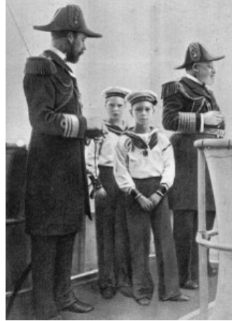
The painfully shy and usually unnoticed Prince Albert, later to be King George, stands in front of his elder brother, Prince Edward.

In the years that George VI was King, not only was he forced to face his worst nightmare of having to speak to an audience of countless listeners, but what came out of his mouth could NOT be in any way laughable or open to mimicry, let alone indicate any of the mental anguish or physical strain and discomfort his extreme stammering created. In those crucial choice years of his reign, Radio was live and real time, there was no other way to give broadcasts. Around the globe, people sat at the foot of their radios, since it was the life's breath of yet another War that had come upon the world's stage. Instead of being held in a glitzy radio station studio, the reality of the King's speeches stressfully took place in a small, dank, stuffy room, with no one else present but his speech therapist at his side, ready to assist should a muscular throat spasm harden and freeze The King's throat.