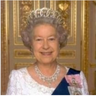
Her Majesty, Queen Elizabeth II, Daughter of George VI.

In the time between writing an article last November about a yet to be released holiday season film and the ensuing Oscar buzz from that same piece of celluloid garnering a whopping 12 Academy Award nominations, I was surprised at the backlash reactions of so many to The King's Speech , written by David Seidler, due it being considered a "period piece".