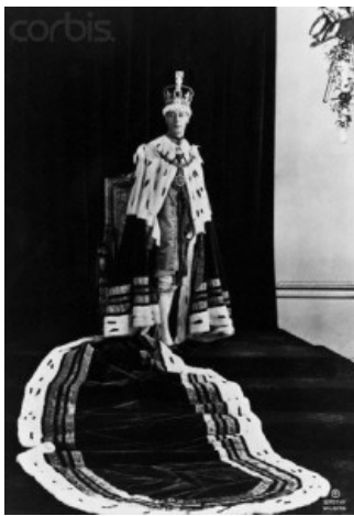
King George VI of England on his Coronation Day, May 12th, 1937

the only crowned heads of Europe who refused to leave their subjects during the life threatening events England underwent throughout the The Second World War. The royal couple and their 2 young daughters endured the horrors of the constant nightly bombs from the Nazi Blitzkrieg , sitting amongst their people in the bomb shelters of London during the summer of 1940.