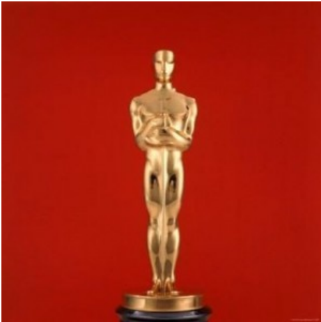
This Leading Movie is Nominated for 12 Academy Awards This Year

The 2 speech giving Brits were Prime Minister Winston Churchill and King George VI, the man whose impediments and presentations of speech are portrayed in the film which stands to sweep this year's Academy Awards, The King's Speech .