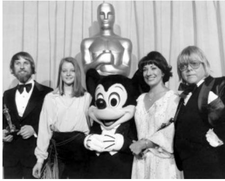
Paul Williams at the 1977 Oscars

For the Grammys in general, it proved to be another eclectic show, opening with Beyoncé 's steamy performance with husband Jay Z on "Drunk in Love," and continuing with a blend of young and old, hip hop and country, classic and offbeat, Carole King dueting with Sara Bareilles , all a way of celebrating the vast musical canvas that is the record industry in 2013. LL Cool J introduced himself as host and talked about music's power to unite people across the world. "Make some beautiful noise," he said, before moving on to the evening's first award.