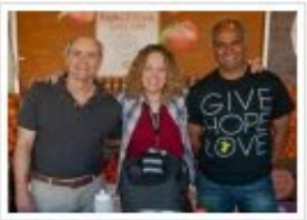
The Giving Spirit, Whole Foods Market Brentwood Partner To Help LA’s Homeless