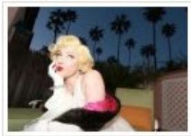
Suite 100 to Celebrate Beverly Hills Centennial

View all posts by Westside Today Staff »