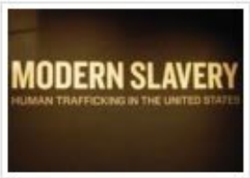
Los Angeles World Affairs Council Hosts Human Trafficking Talk