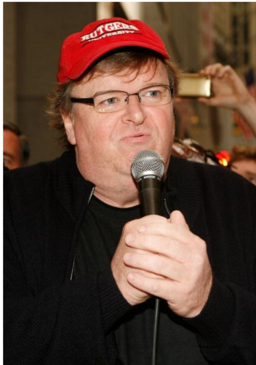
Michael Moore