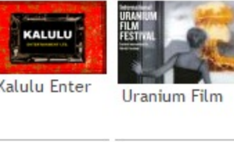
Kalulu Enter Uranium Film