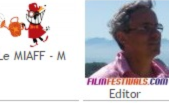
Le MIAFF - M Editor