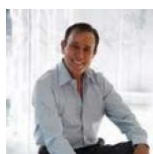
Wake Up to Younger Skin!