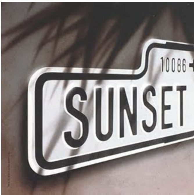
Natural Mind is located on Sunset Boulevard

In the meantime, if you are looking of a highly personalized salon or spa experience, then you owe it to yourself to pay a visit to the original Natural Mind Beauty & Beyond. It promises a very transformational, and actually life changing experience, and if you can get an appointment on a Friday, you can enjoy the additional satisfaction of a glass of wine, some tasty appetizers and live music, all in a beautifully designed space that is quickly becoming a significant creative social center in the community. One thing is for sure: You will leave happy, uplifted, relaxed and joyful as that very transformation you have been looking for just finally caught up with you!