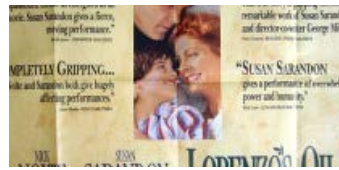
The Lorenzo's Oil Factor From Miracle to Tragedy to Miracle