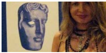
The 2009 Britannia Awards by the British Academy of Film and Television Arts (BAFTA) in Los...