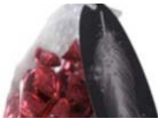
The Most Luscious Wisp of Happiness from Japan: Chocolate!