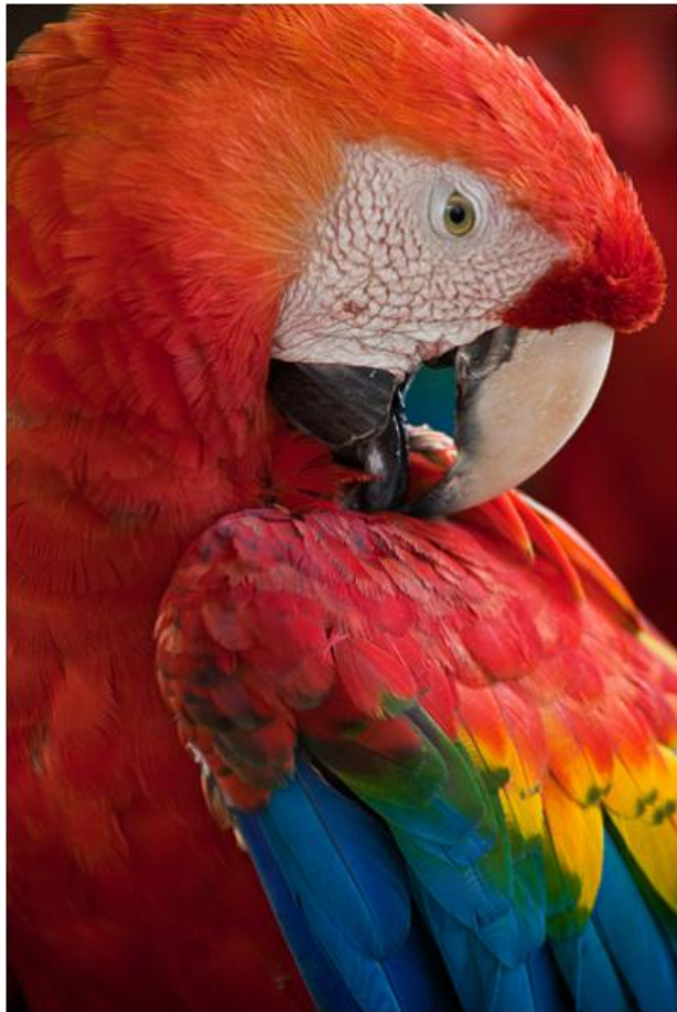
Exotic Bird by Laszlo Kupa